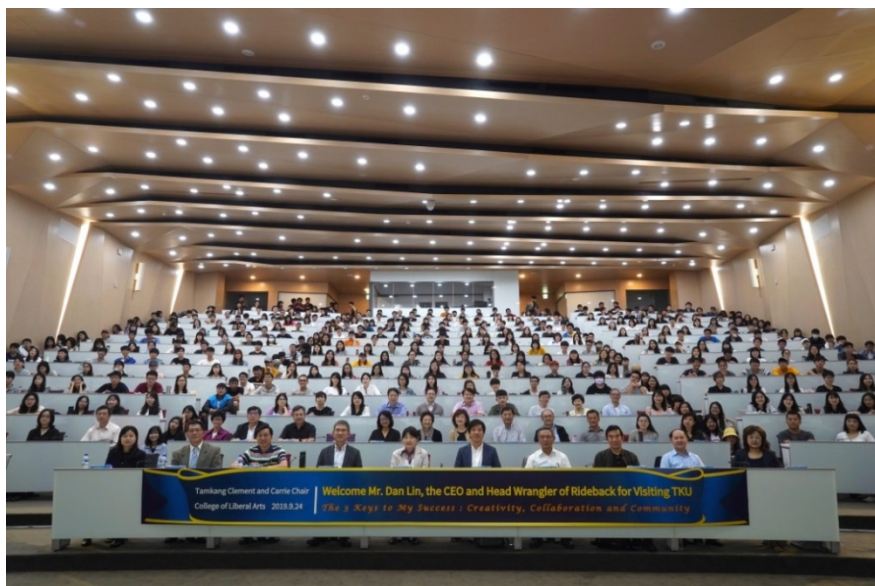
A group photo for the speaker with all participants