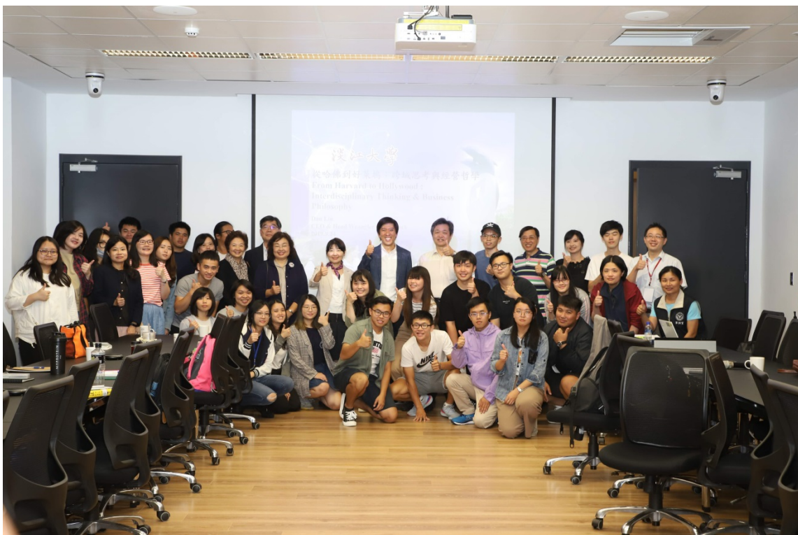
A group photo for the speaker with TKU staffs and students after symposium