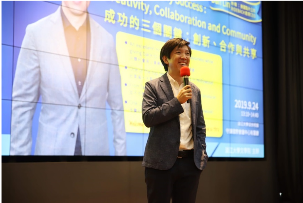
Giving a speech at the Hsu Shou-Chlien International Conference Hall